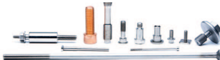
Bolts | Nuts | Screws | Washers | & More