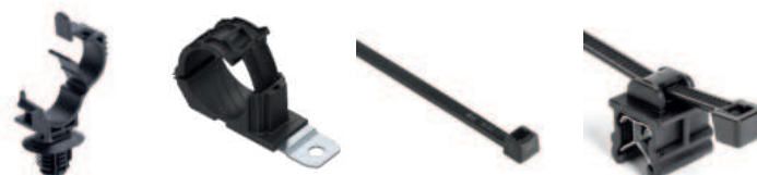
Mounts | Clamps | Zip Ties | Edge Clips