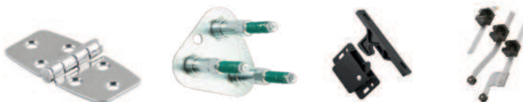
Kitting | Sub Assemblies | Enclosure Hardware